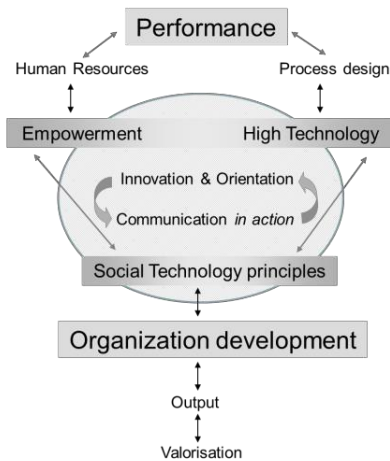
Figure 1: Example of a strategy in order to demonstrate how sociotechnology principles can be used as a tool for integrating process technology process and HRM in order to develop a system of communication in action and innovation. Organizational development with inclusion of sociotechnology results in a reliable strategy for valorisation of innovation output.

between employees. Key performance indicators include individual competence of cooperation, exploration of creative power for professionals, application of individual talents and innovative knowledge exchange, pooling of multi-professional innovative expertise. Focussing on key performance indicators concerning socio-emotive dimensions will encourage ambition and social interaction between professionals in case of innovation processes.