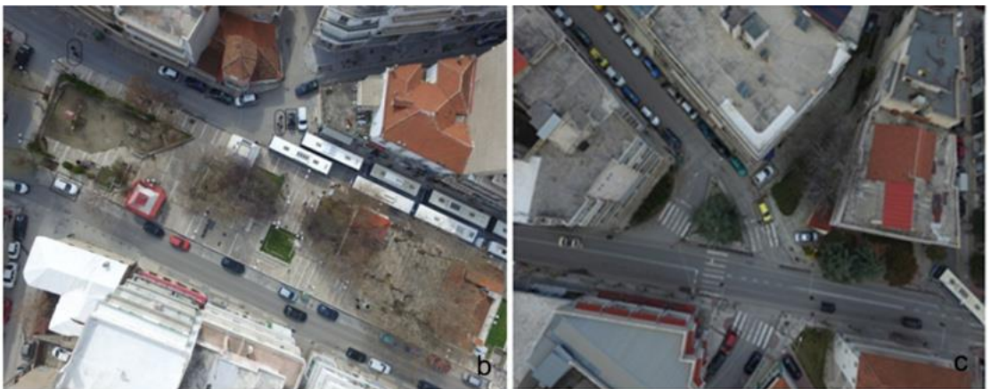
Figure 6. Mobility and parking behaviors.