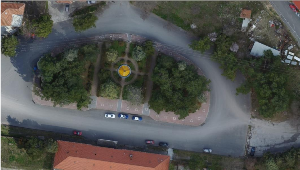
Figure 4. Part of the study area presented in the new orthomosaic (2017).