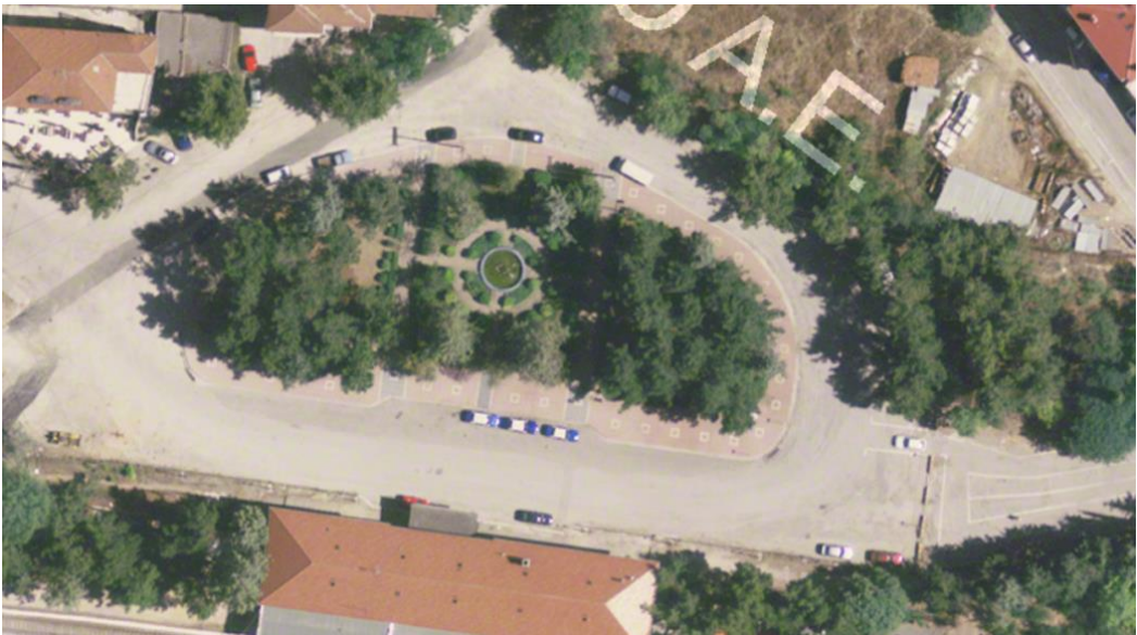
Figure 5. Part of the study area presented in the old orthomosaic (2007-2009).

The next parameter to be evaluated was the resolution of the orthomosaic produced. For this purpose, the quality of the new orthomosaic was compared with the old one (the official one) that was developed during the period 2007-2009. The GSD in the