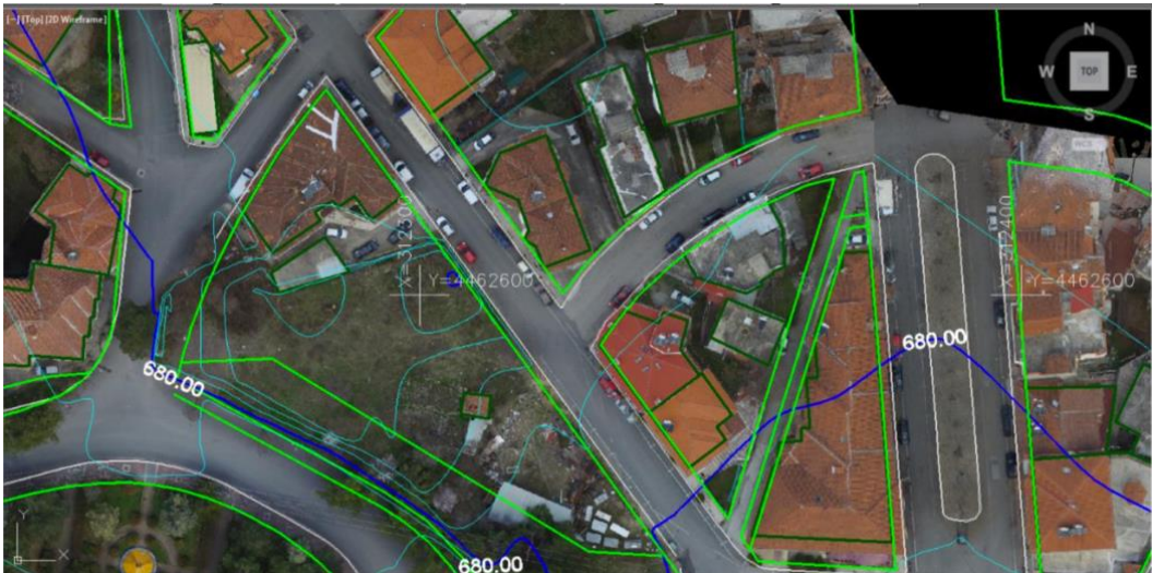
Figure 3. Comparing the new orthomosaic with the official urban plans.

In order to evaluate the reliability of the data obtained, it was decided to compare the produced orthomosaic with the pre-existing one and with the layout of the existing urban plan. Following the comparisons, a common conclusion was extracted: there were slight variations between the new and old orthomosaic and the layout coincided to a large extent. As mentioned in the previous section, differentiations were expected due to the fact that the urban form could be changed over time and informal housing could be developed. However, such phenomena have not been observed. Figure 3 shows the match between the layout of the buildings and the new orthomosaic, demonstrating that urban planning regulations were followed to a sufficient extent. This observation is related to the fact that: (a) the area studied was constructed decades ago and (b) the general trend in Greek urban planning system is to recognize and legalize the pre-existing urban morphology.