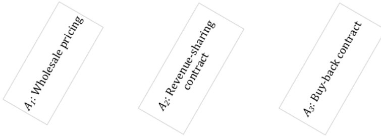
Figure 2. Decision Hierarchy

Doing pairwise comparisons and calculating criteria weights are the next steps. This phase consists of three steps: determining the relative importance of the criteria by pairwise comparisons, determining weight vectors, and determining the consistency. The scale developed by Saaty (1977) provided the values 1-9 for the comparison.