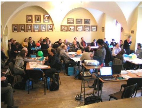
Fig.2. Workshops with public participation is a tool to define needed parking zones.

However, participation is not only a tool for creation of social design concepts and public consultation of planned investments. The residents readiness for taking action in common spaces manifests itself in increased participation in various kinds of artistic projects that require creativity and an open attitude towards the activities in public space. The creation of fashionable, unique and attractive places require the use of unusual, unexpected solutions. Today's technical capabilities make it possible to design and furnish the space in such a way to provoke users and residents to specific interaction with it. The use of interactive gadgets in the form of smart infrastructural devices, the intentional design of lightning, pavement texture and sound, can make the streets more friendly – mostly for pedestrians and cyclists.