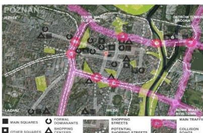
Fig.1. Urban structure of Poznan city centre in a context of main traffic problems.

One of the factors that negatively affects the dynamics of spatial transformations leading to the renewal of downtown, is certainly inefficient transportation system. Tailored to the needs of the city of the second half of the twentieth century, where the car was the dominant mean of transportation, now is a generator of many spatial conflicts. The failure of the construction of planned bypasses resulted in the need to broad the streets inside the city and thus fragmentation of urban tissue. Shopping streets connecting the Old Town with the district centers have been cut up and lost its attractiveness due to the lack of continuity of functional relationships and apparent disintegration of space. Of course, not only a bad situation of vehicular communication is responsible for the collapse of Poznan shopping streets. The low level of attractiveness of the downtown public spaces results in increased interest in areas on its periphery and the outflow of capital to these areas. Today, more Poznanians are shopping in shopping centers on suburbs than on the promenades and passages of the Old City. This results in even greater collapse of the valuable fabric of the city and its slow degradation.