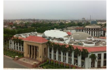
Figure 21. Assembly Hall Building (1935)