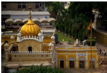
Figure 14. Samadhi (tomb) of Ranjit Singh

There is not much literature available about Sikh architecture in Lahore, probably due to biased opinions of both British and Muslim writers. During the 1740s, frequent invasions by Afghans led by Ahmed Shah Abdali and chaos in local government had made life very uncomfortable for the citizens of Lahore. With the dwindling Mughal power, Lahore too declined in both population and wealth. It was during the reign of Aurangzeb, when conflicts in the Deccan had turned the Mughal emperor's attention towards the south dominions, a fierce and energetic warrior Rangit Singh plundered the Mughal Lahore. After the occupation of Lahore, he united the various Sikh bands and became the Emperor of Punjab. He shifted his capital from Gujranwala to Lahore. For a brief period of 1799 to 1846, Lahore recovered under the patronage of Ranjit Singh and his successors, for almost fifty years.