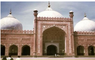
Figure 12. Badshahi Mosque Lahore, by Aurangzeb Alamgir (1673)

These monuments exist even today and render distinction to Lahore as a “City of Gardens” (Husain et. al., 1984). During the Mughal rule (1524 to 1712) Lahore city had touched the peak of its grandeur. The architectural contribution of the last of the Great Mughals, Aurangzeb (1658-1707), was the most famous monument Badshahi Mosque (1673) and the Alamgiri Gateway to the west side of the fort. The Badshahi Mosque was Aurangzeb’s legacy to the city (figures 12 & 13).