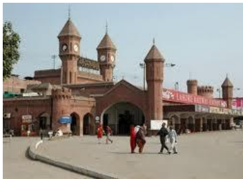
Figure 16 Lahore Railway Station (1861)

The transformation of an Indian town, Lahore, into a Colonial city, particularly the evolutionary development of its architecture was prominent. The typology of buildings introduced by the British was not known in this land before (Thornton, 1924). By the end of the British rule, Lahore, the capital city of the Mughal emperor Akbar, the centre of the Sikh Kingdom, stood transformed with a dual-faced identity. On the one hand was the old city and on the other, were the colonial additions of the Cantonment and the Civil Lines. The contrast was blatant not only in the relative hygiene of the areas, but also regarding the urban pattern, house design, shopping habits, living styles and cultural ethos. The focal point of this colonial city became the precinct of Anarkali with the Mall as an arterial connection with the cantonment (Walker, 1894).