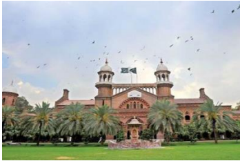
Figure 19. The high Court Lahore (1879)