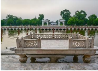
Figure 9. Shalimar Garden Lahore by Shah Jahan (1642).