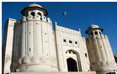
Figure 13. Alamgiri Gate by Aurangzeb Alamgir(1673)

Mughal not only bestowed an enduring architectural heritage on the city, but also laid the bases for its social organization. Unfortunately, most of these Mughal wonders were plundered during the Sikh rule of Punjab (Naqvi, 1972). Mughals not only bestowed an enduring architectural heritage on the city, but also laid the bases for its social organization. Later developments followed by the Sikhs and the British followed the infrastructure laid down by the Mughals.