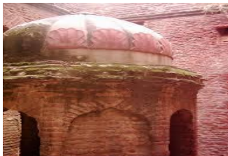
Figure 3. Temple of Loh in the Lahore Fort

Indian subcontinent has had the history of different religions that prevailed in this land for different periods. The people of these religions like Idolaters, Hindu, Muslims, Sikhs and the British produced the architecture which was representation of their religion, culture and economy. The legend narrates that Lahore was founded by Hindu Prince, Loh, son of Rama and the hero of the Hindu epic, the Ramayana (Peck, 2015). Its evidence is the subterranean Temple located in northern part of Lahore Fort, and memoir of its ancient past credited to Rama (figure 3). Followers of religions like Hinduism, Sikhism and Islam produced architecture which represented their religion besides secular buildings like palaces, bridges, forts, etc. It is mostly the religious consciousness that has been emphasized through the treatment of the wall surfaces by these religions (Brown, 1942). The quality of the architecture is its spiritual content evident through the buildings. It is represented in concrete form through the prevailing religious consciousness of the people.