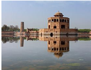
Figure 7. Hiran Minar, a hunting Ground at the outskirts of Lahore built by Jahangir.