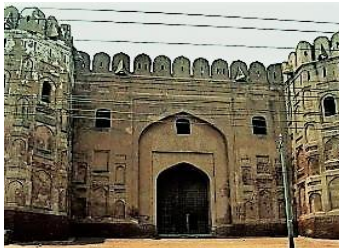
Figure 6. Masjidi Gate Lahore Fort (1566 AD)

Among all the rulers, the Mughals have left their indelible influence on the art and culture of Lahore. During their rule of almost two centuries (185 yrs) (Sanders, 1933), they made Lahore almost the second capital of India. A traveler from Europe in seventeenth century, described Lahore as extensive and populous city, with bazars full of valuable goods (Nilson, 1968). The first Mughal Emperor, Babur captured Lahore in 1526. Later on, Lahore remained as capital of India for 14 years from 1584 to 1598 during the reign of Akbar (1556-1605), the 3 rd Mughal Emperor. He rebuilt the already existing Fort and enclosed the city with burnt brick wall having 12 prestigious gates. Among these gates, the famous Masjidi Gate was constructed in 1566 A.D just opposite the eastern gate of Lahore Fort (figure 6). His successor, Emperor Jahangir, was very fond of this city and used to hold courts here. He and his wife, Empress Noor Jahan have their tombs at the north-west periphery of Lahore city (figure 8).