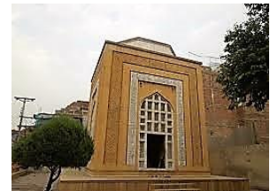
Figure 5. Tomb of Sultan Qutb-ud-Din Aibak, Anar kali Lahore