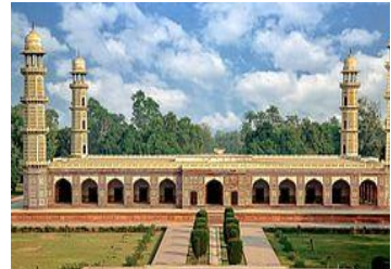
Figure 8. Jahangir's Tomb, built by Shah Jahan (1627)

He is also famous for the construction of a hunting resort, Hiran Minar at the outskirts of Lahore (figure 7). The next heir was Shah Jahan, who was born in Lahore. The famous Shalimar Garden was built by him in 1642 (figure 9). Among all the Mughal Emperors, he was known as the "Great Builder". During these days, Lahore became a royal residence where Mughal emperors spend some time every year. As a result of these royal connections, Lahore has acquired many Mughal architectural valuables. Jahangir and Shah Jahan's architectural contributions included the extension of Lahore fort, construction of mosques, tombs, gardens, palaces, royal courts, caravan-sarais , hammams , city walls, havelis (royal residences) etc. (figures 10 & 11).