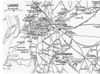
Figure 2. Guide Map of Lahore City