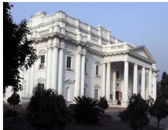
Figure 17 The Quaid e Azam Library (1864)