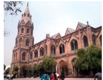
Figure 18 Govt. College Lahore (1877)