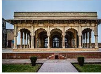
Figure 10. Diwan e Khas Lahore fort by Shah Jahan (1640)