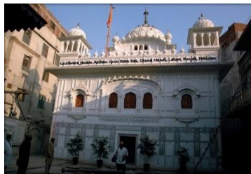
Figure 15. Guru Ram Das Ka Gurdawara Chuna Mandi Lahore

The Sikh rulers started with the construction of religious buildings in the city, which included the Gurdawaras (Sikh religious building) of Sikh, Hindu temples, and mosques. By 1812, Ranjit Singh had mostly refurbished the city's defence by adding a second circuit of outer walls and Dharamshalas (Hindu religious rest house). His death in 1839 ended his reign, and his son Dulip Singh was nominated as his successor. He was buried in Lahore. The significant monument of Sikh architecture is the Samadhi (mausoleum) of Ranjit Singh. His son and grandson are also buried here (figure 14). The design of the building as usual is a combination of Hindu and Muslim style, but the effect at a distance is not unpleasant. A religious building of the Sikhs, still exist today at Chuna Mandi Lahore, named Guru Ram ka Gurdawara (figure 15). For the construction of Sikh monumental buildings, marble and semi precious gems were stripped off from the existing Mughal buildings from all over the empire. In general, instead of protecting the ancient buildings, the Sikhs misused, knocked about a bit, let a few survive and added a few new ones.