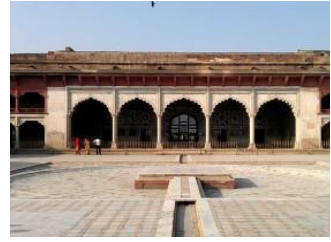
Figure 11. Sheesh Mahal, Lahore fort by Shah Jahan (1640)

These monuments exist even today and render distinction to Lahore as a “City of Gardens” (Husain et. al., 1984). During the Mughal rule (1524 to 1712) Lahore city had touched the peak of its grandeur. The architectural contribution of the last of the Great Mughals, Aurangzeb (1658-1707), was the most famous monument Badshahi Mosque (1673) and the Alamgiri Gateway to the west side of the fort. The Badshahi Mosque was Aurangzeb’s legacy to the city (figures 12 & 13).