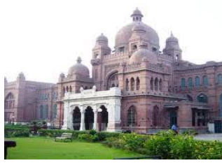
Figure 20. Lahore Museum (1890)