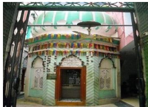
Figure 4. Tomb of Malik Ayaz built circa 1040 (Rang Mahal Lahore)