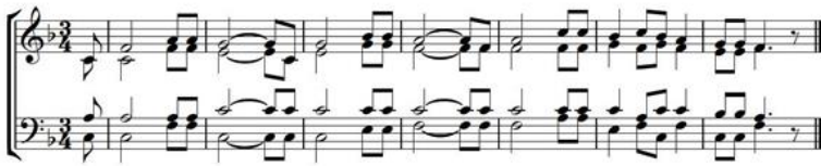
Figure 3: Musical transcription (own transcription) of the spiritual folk song ‘Tate, roma nna’ - Father send me (my transcription). (Transcription C; my transcription) shows the song ‘Tate, roma nna’ (Father send me) in instrumental version. This was performed by Lobethal Congregation, and accompanied by Kenny’s Brass Band, Ga-Phaahla Mmakadikwe, Limpopo Province – South Africa; Date: 23 rd of June 2019.