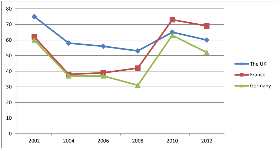
Figure 3 Percentages of the Favourable Feelings on the USA, 2002-2012

Source: Pew Research Global Attitudes Project (2012). Opinion of the United States. Global Indicators Database . Retrieved from http://www.pewglobal.org/database/indicator/1/survey/1/