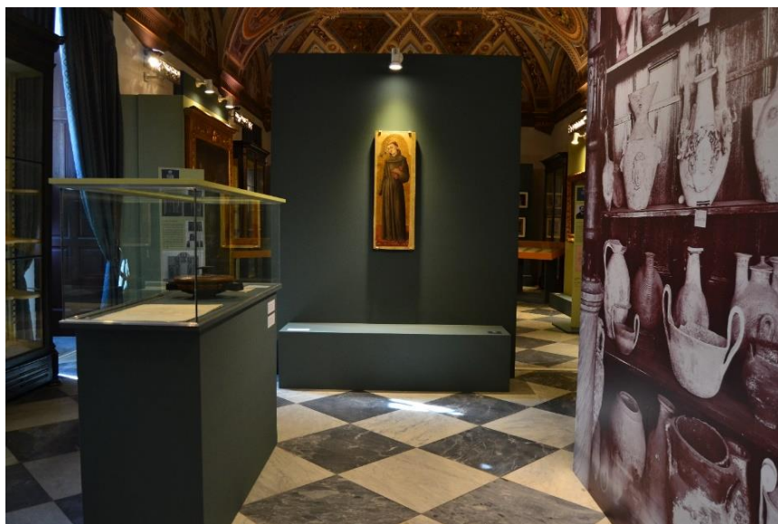
Fig. 4: Saint Antonio by Antonio Vivarini and the riproduction of Ungaretti's niche.

family in its palace in Ruvo, today partly home to the National Museum, from where a very precious sphinx-shaped rhyton arrived for the occasion, which certainly in the residence in the question was accompanied by paintings of absolute value, including a 'Lucrezia' by Artemisia Gentileschi. This painting is recently dispersed on the antiques market, which means a serious cultural impoverishment for not only the regional heritage. Also in this section, there was the possibility of also telling what exceptional happened immediately after 1928, the closing date of the Provincial Museum. This is the commitment of Federico Hermanin, German born in Bari and director of Palazzo Venezia during the twenty years (Nicita, 2000), who will send paintings from the Corsini and Barberini Galleries in Rome to the Apulian capital - including Luca Giordano on display - to graft them onto the pictorial nucleus of the ancient Provincial Museum (the Museum That Was There, That Has Been and Has Never Been) thus giving life to a new and independent Pinacoteca (Hermanin, 1930).