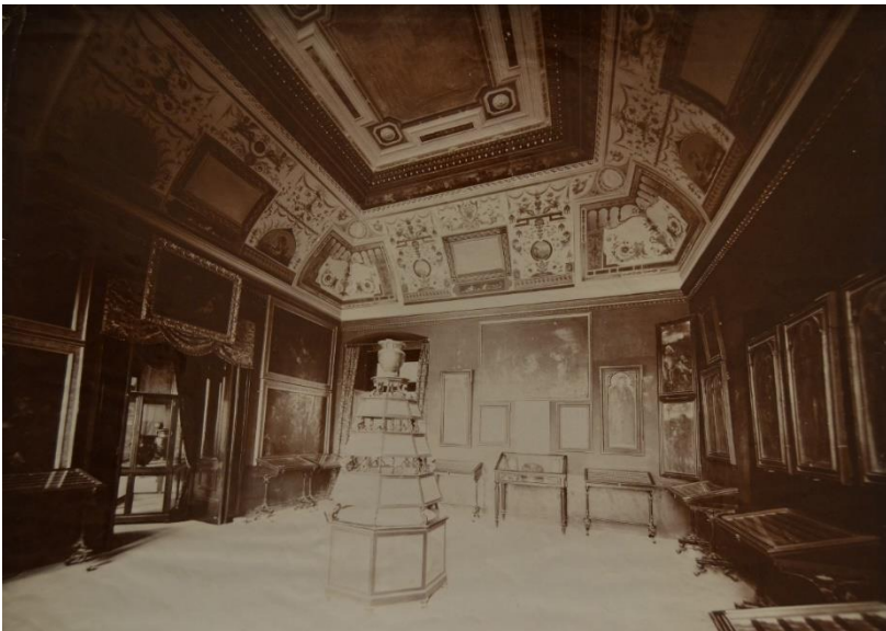
Fig. 3: The ancient Pinacoteca in the Palazzo degli Studi of Bari. 1890-1910.