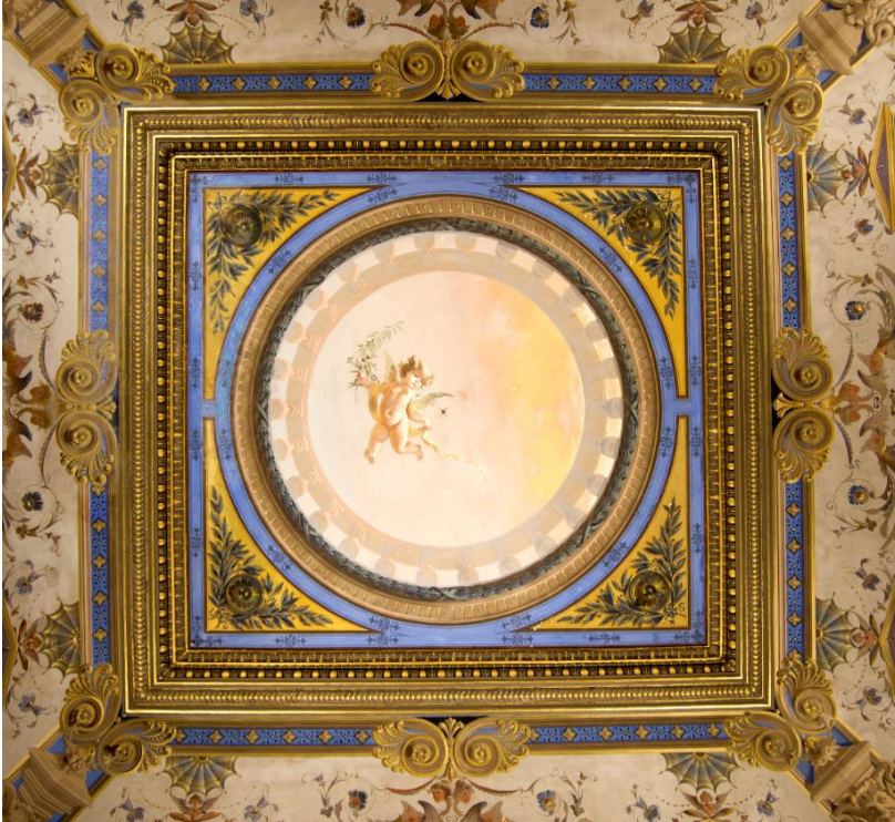
Fig. 2: Frescoed ceiling by Rinaldo Casanova. Palazzo degli Studi, Bari.