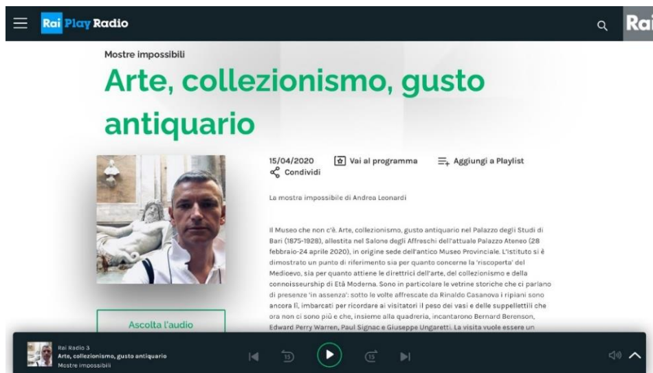
Fig. 9. Podcast in RAI-RADIO3-'Mostre Impossibili'.

On April 15, when the awareness had already established that it would not be possible to reopen the doors of the exhibition to visitors, the online magazine of S.i.S.C.A. (Italian Society of Art Criticism History) has dedicated a large insert to the exhibition entitled 'The Museum that is not there: the treasures of history on display at the University of Bari' (Petronella, 2020). Finally, the video (Youtube 1) created for the #PilloleDiCultura section of the Lyceum International Club in Florence (historic women's cultural association) on 22 June, therefore following the dismantling of the exhibition in the second half of May.