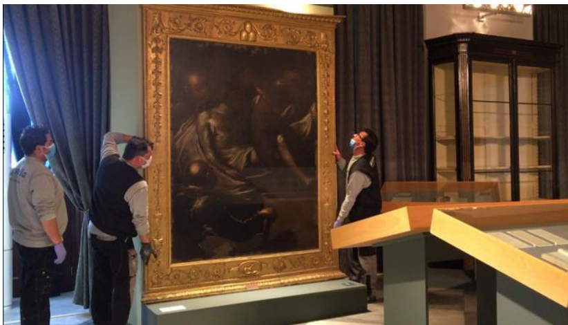
Fig. 8: Dismantling exhibition.

Museo che non c'è (più)'; 2) 'The Atheneum' (dedicated to the construction and decoration of the Palazzo degli Studi in Bari); 3) 'Il Medioevo al Museo'; 4) 'Il Rinascimento veneto al Museo Provinciale di Bari'; 5) 'É tempo di agire. Edward Perry Warren e Bernard Berenson'; 6) 'Non solo stoviglie. Il collezionismo Jatta'; 7) 'Dall'uno al molteplice. Musei campani dopo l'Unità'; 8) 'La Pinacoteca è già più di una promessa. 1930 Federico Hermanin'; 9) 'La nicchia di Ungaretti con Raffaella Cassan'; 10) 'Margherita Nugent, storica dell'arte del primo Novecento'. These ten are joined by two others (video 11-12), the "Costruzione del museo effimero" and 'La Mostra che non c'è', respectively concerning the set-up and dismantling of the same. It should be noted that the second occurred, given the impossibility of an extension, in the midst of the transition between the so-called 'Phase 1' and 'Phase 2' of the lockdown imposed by the Italian Government. Faced with this type of communication, the response from the public was more than positive with over four thousand contacts in total, recording an average of 360 views for each of the videos produced, oscillating between the 581 views of the most followed video and the 190 of what has the interest of the public was less aroused.