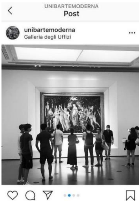
Fig. 6: An Instagram post of @Unibartemoderna.

Without claiming to be complete, it will suffice to mention here how the MiBACT (Ministry of Cultural Heritage and Activities and Tourism) has renewed its YouTube channel, uploading short illustrative videos of those museums, collections and archaeological sites on a daily basis to which the health seals had been placed, finally trying to involve the much-discussed 'non-public' (Solima, 2020). We also tried to intercept the public through a social network with a younger target like Instagram, for which the hashtag #artyouready was specially designed, which today has more