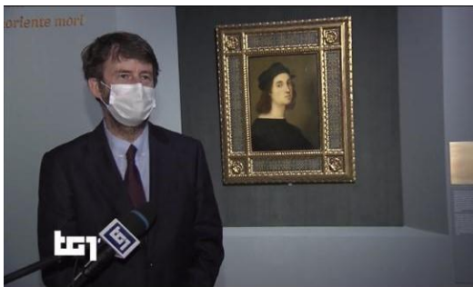
Fig. 1: The Minister of Cultural Heritage at the post-covid reopen of 'Raffaello 1520-1483'

COVID19 has made it necessary to rethink the dialogue with visitors, a dialogue already in crisis and now complicated by the need to do it 'on the run'. It will probably be possible to verify the effects of unprecedented circumstances only in the long term, as well as the scientific stability of the various popular formats linked to the innumerable and sometimes questionable (even only in terms of taste) proposals online.