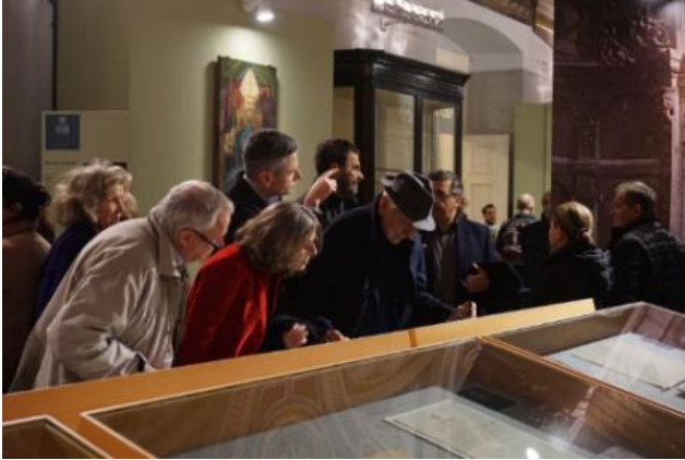
Fig. 5: During the inauguration day of 'Il Museo che non c'è'