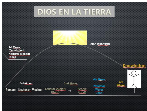
Figure 2. Five moves in Celestial and Earthly Spaces in "Dios en la tierra"

of descent or of degradation, "... y encontrar en esta degradación, en esta corrupción aparente, no una manifestación del mal en términos absolutos, sino un momento en el camino de la superación dialéctica de la realidad" 1 (1979, p. 23). A textual movement that is none other than the internal evolution of reality, which most of the time becomes Revueltas, a repulsive encounter, because what he finds, according to Escalante, is "la verdad del acabamiento" 2 (1979, p. 26). The important thing is this Internal Movement that Revueltas explores to its ultimate consequences, not only verbally or thematically but in the same trajectory of his characters; and this movement is what basically separates Revueltas from any resemblance to Socialist Realism, which, according to Vicente Francisco Torres M., "hace de la realidad un espantajo momificado, antidialéctico" 3 (1985, p. 51). Thus, I will illustrate, from figure 2, the movement of this literary machinery in the story "Dios en la Tierra". For such an assignment, I have divided the text into five moments or movements, to follow the logic of Revueltas, which are clearly framed in the Space-Time progression of the story.