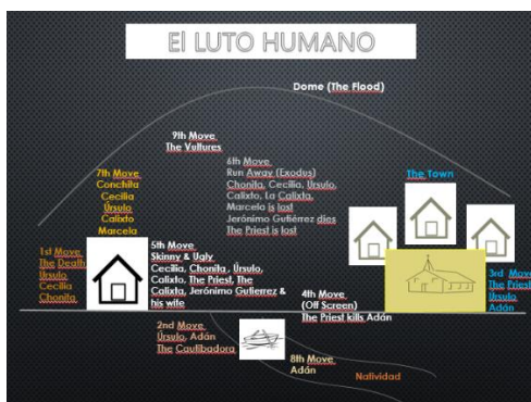
Figure 3. Nine moves in Celestial and Earthly Spaces in "El luto humano"

I will review, to point out these ideas, the aforementioned novel El Luto Humano , through equal of an illustrative figure (3) and its brief explanation.