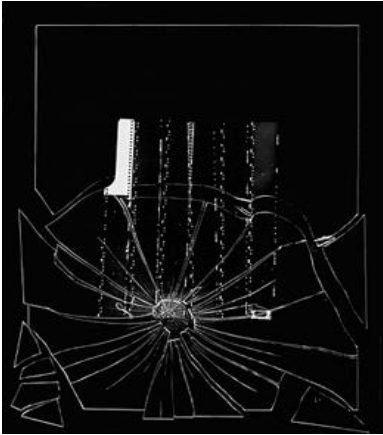
Figure-8: End of the Verification. To Marcel Duchamp.

Mulas preferred to finish his series with the first work of this series (see Figure-8). In this work, the artist used the glass item as the different from the first work of this series. Glass has added a new character to this composition physically and visually. Alongside broken glass associated with brings to mind the works of Duchamp (like Large Glass), it is significant that this fracturing process can never be repeated in the same way.