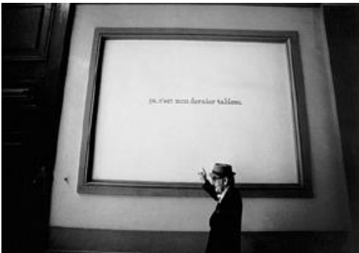
Figure-7: Caption To Man Ray.

In laboratory verification (see Figure-6), the development and fixing chemical steps, that the camera is not included in the dark room, are emphasized. Mulas was devoted this work to the famous chemist Herschel, highlights that everything is done by hand in the laboratory. The paper is taken out, the paper is placed under the enlarger, the focusing is done, enlarger is lifted and lowered, the paper is taken again, the paper is put into the paper developing chemical, washed, reinserted and placed in the fixing bath. In this work, the hands are the main character of the story, and the only subject is a pair of photographs. Artist; He put and pressed his hands on the photographic paper under the enlarger and to divide the paper to pairs two parts.