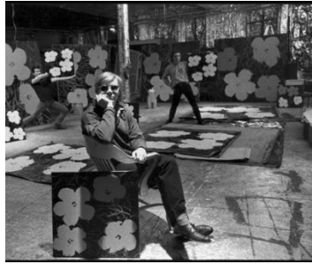
Figure-2: Andy Warhol, New York, 1964

"Ossi di Seppia" project that includes the interpretation of Italian Poet Eugenio Montale's poems via photography is another successful example of intertextuality in photography. In Figure 3, Mulas interprets Montale's following lines: