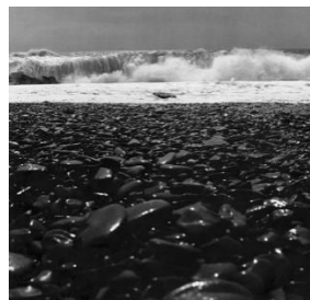
Figure-4: Per "Ossi di Seppia", Monterosso, 1962.

"Verifications (1968-1972)" that is the last photography series of Ugo Mulas, before his death, is completely based on the use of intertextual transactions in photography. Mulas has tried to draw attention to the importance of masters in the history