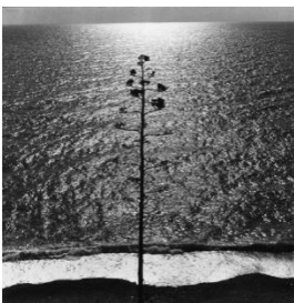
Figure-3: Per "Ossi di Seppia", Monterosso, 1962.

"Oh then tossed like the cuttlefish bone from the waves fade away little by little; become a wrinkled tree or a stone smoothed by the sea; in colors merge with sunsets; disappear meat to bring out drunken source of sun, from the sun devoured ..." (Pirelli, 1965:69)