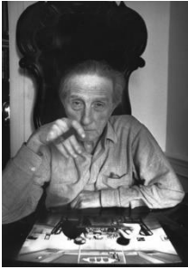
Figure-1: Marcel Duchamp, 1965.