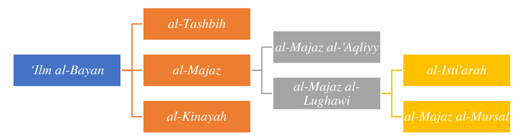
Figure 2 The types of al-Bayan according to al-Hashimiyy and 'Abbas