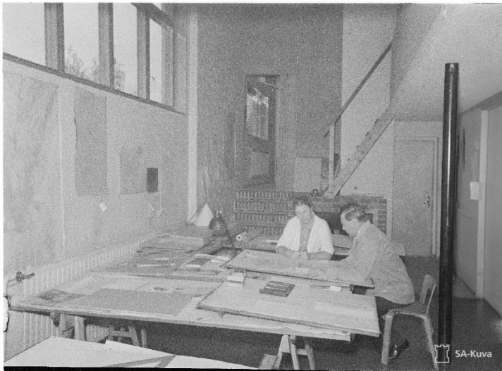
Photograph 2. At work.

Without photographs, this analysis would lack impact. The use of a sample pair of photos sheds light on the matter in many ways. We begin the inspection of the Aaltos' home with an "inner gaze": an examination of the essence of the interior.