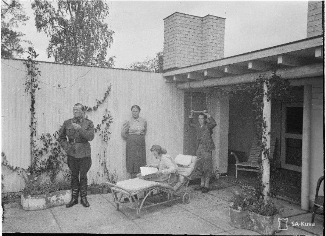
Photograph 4. Sheltered privacy.

A pair of photographs rich in content is needed to analyze the Aaltos’ artistry. It should also shed light on Alvar Aalto’s philosophizing, which is deemed masterful. What is of particular interest now is to examine architectural insightfulness.