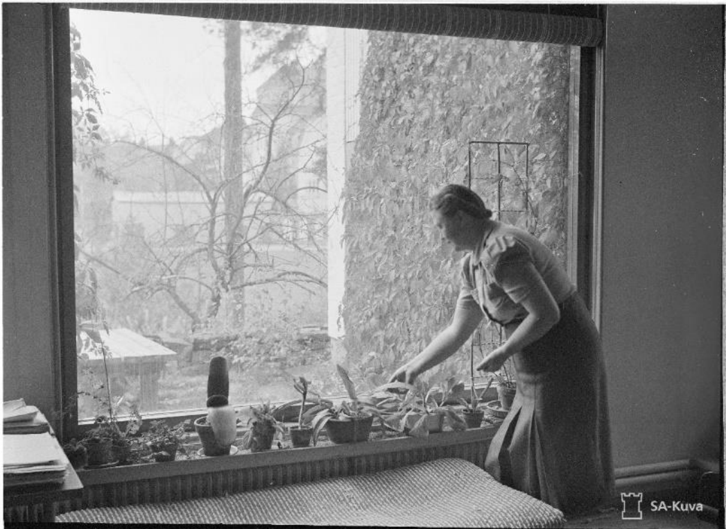
Photograph 6. Spirit and life.

Fate appeared as a travelling companion. Sorrow arrived. The twosome became a onesome. Yet Aino Aalto's spiritual presence is also felt in this modern age of the 2020s. The narrative power of photography is undeniable.