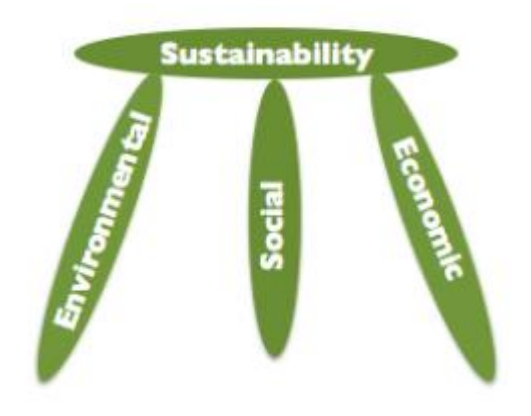
Fig. 2, Three legged stool model

Prism Models or 3 overlapping circles model