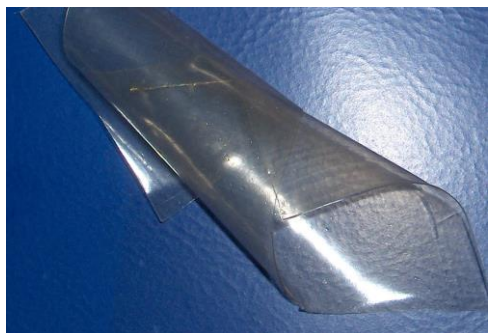
Fig. 3. Collagen membrane

Collagen membranes are semitransparent, even, elastic, and relatively enduring enough in order to be plied and rolled in tubes (fig. 3) [1]. They can either be one or multi layered and they can have textile insertions, which enhance their mechanical resistance.