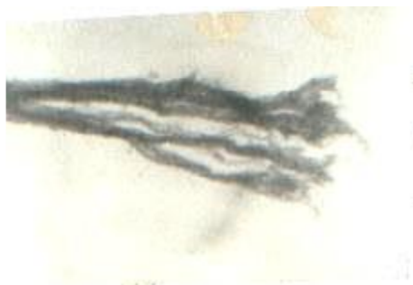
Fig. 1 Non-tanned collagen fibre (size 40x) [1]

in a helicoidal manner. Fibres are elastic, which allows them to curve under different shapes, the most frequent one being represented by the semicircle shape.