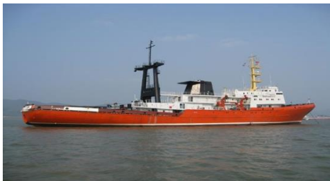
Ocean-going salvage tug (fig 2)

One very useful type of vessel is the tug. They are divided in three basic types. A river tug is designed to work on inland waterways. Tugs must be designed to satisfy three important requirements: be stable in all conditions, be manoeuvrable and powerful enough to move ships of far greater size.