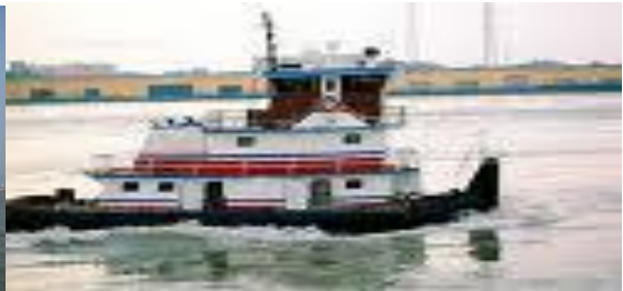
river tug/pusher(fig 3)