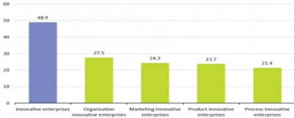
Fig. 3.1: Enterprises according to the type of innovation