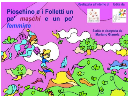
Figure 5. A pixie whose identity expressions go beyond gender dichotomies and whose identity, in his world, is not subject to social stigma . In his identity, this pixie includes different nuances and/or dimensions belonging to both the stereotypes defining male and female , considering it as an added value. Gianola, M. (2016), Pioschino e i Folletti un po' maschi e un po' femmine , "Gender Identity Culture" Foundation, Naples.