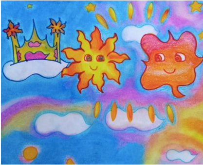
Figure 4. Cover of Pioschino e i Folletti un po' maschi e un po' femmine , where Duccio, a child from Earth, discovers the existence of different realities where the equilibrium between nature and the various forms of existence is paramount. Gianola, M. (2016), Pioschino e i Folletti un po' maschi e un po' femmine , "Gender Identity Culture" Foundation, Naples.