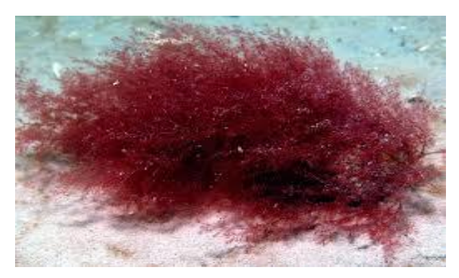
Figure 1. Red algae in the algal colony