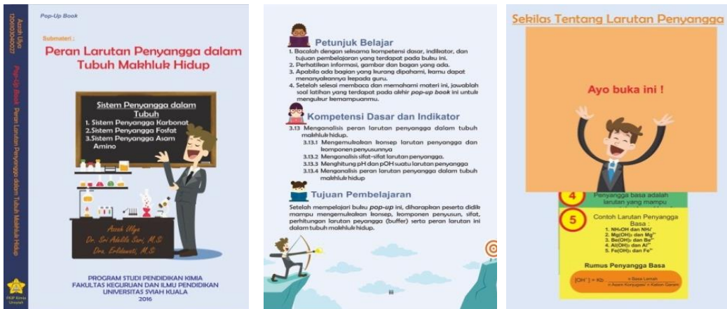
Figure 1. The Design of Pop Up Book