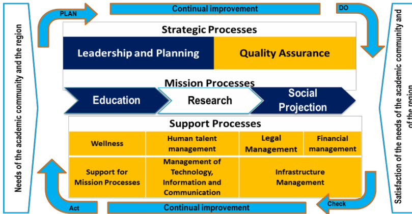
Figure Research design