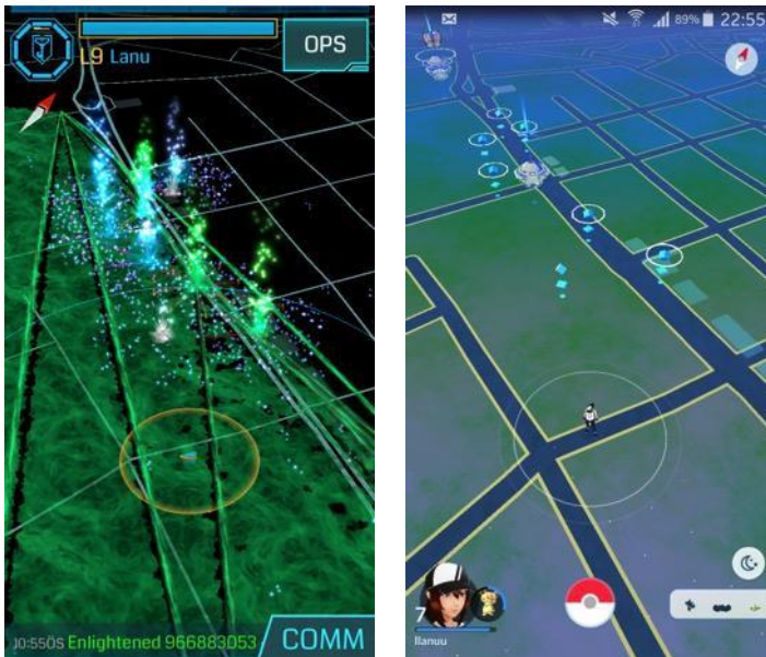
Figure 4: Ingress and Pokémon Go Interfaces

Niantic, a former internal startup of Google (Alphabet Inc.), is a software development company that is specialized on augmented reality and location based mobile games such as Ingress and Pokémon Go. The company has designed, developed and released Ingress in November 2012 and Pokémon Go in July 2016. Both games have very similar architecture yet by means of narrative and game design both games lead a different gameplay experience.