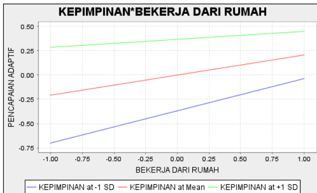
Figure 2. Moderating effect of Humble Leadership

The indirect relationship between Figures 2 show the result of simple slope analysis of moderating effects that support the hypothesis. In particular, adaptive performance was higher among respondents who had a high perception of their supervisor's humble leadership style compared to respondents who had a low perception.