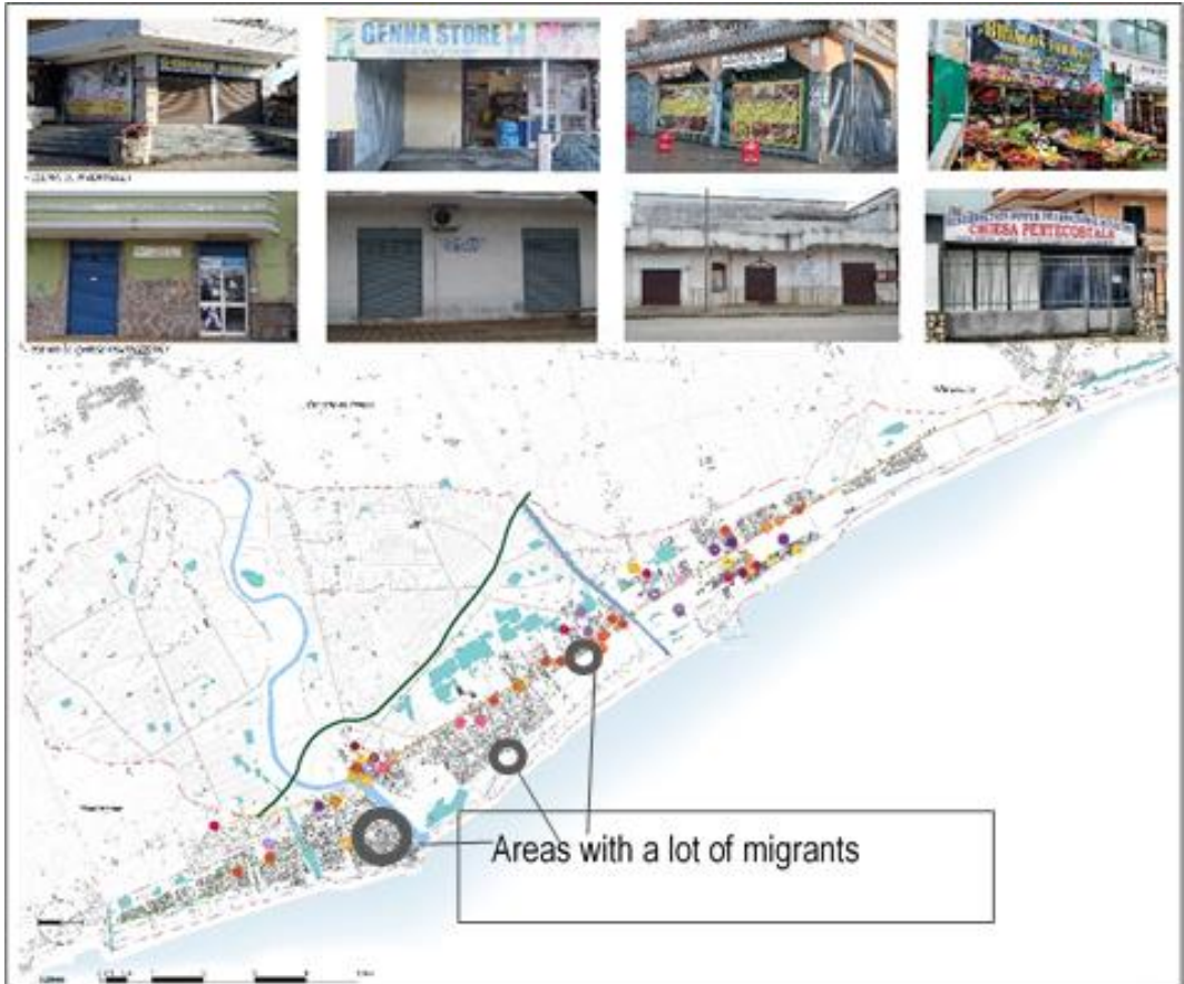
Figure 3 - The planimetry shows the location of the collective facilities in Castelvolturno, including services for immigrant. Marina Manna has made the picture for the diploma thesis with the supervisor Claudia de Biase.