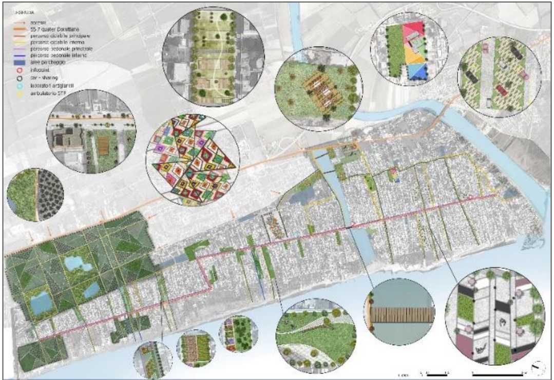
Figure 4- The Master Plan to redevelop the urban area of Castelvolturno to give better urban living conditions to the immigrants and native population. Marina Manna has made the picture for the diploma thesis with the supervisor Claudia de Biase.